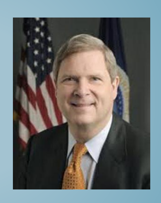
* Tom Vilsack

THERE IS A "LACK OF APPRECIATION IN THIS COUNTRY FOR WHAT HAPPENS IN RURAL AMERICA ... THE PLACE WHERE OUR VALUES ARE ROOTED. *